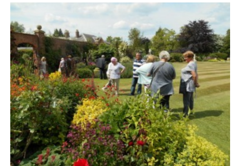
Admiring one of the herbaceous borders at Stoke Albany House

Everyone agreed we had had a very enjoyable day.