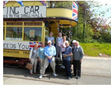
A couple of snapshots recalling the visit to Crich Tram Museum

Any member wishing to discuss any of the issues raised in more detail, please do not hesitate to contact me on 0116 319 0084 or email me on pardeep.narwal@sjpp.co.uk for