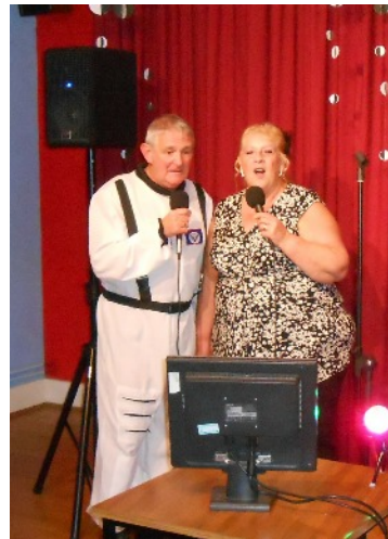
With acknowledgements to "Private Eye"