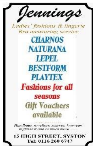
Grateful thanks to all of our Patrons