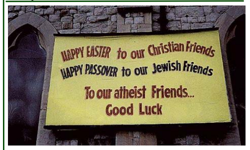
Another eye-catching Church notice

Once again, a very big "Thank you!" to everyone involved.