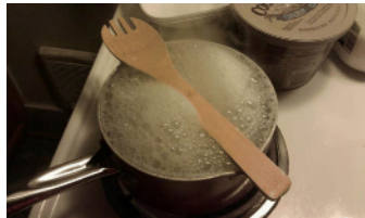
A wooden spoon across a pan prevents boiling over

YOU saw them here first! Handy household hints - a new and valuable Club membership benefit! If you have any tips to share, let us know and we'll print in future editions.