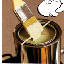
Place a rubber band around an open paint can to wipe your brush on, and keep paint off the side of the can