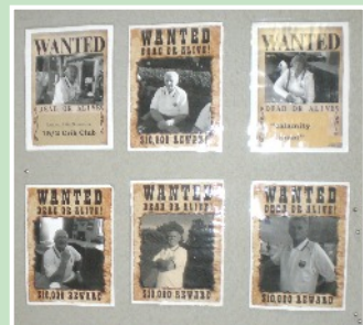
Most wanted varmints