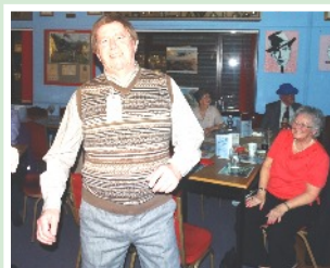
Look everyone I'm dancing