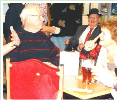
Don't look now but I think there is a German spy behind us!

Many thanks to everyone and we look forward to the next event with anticipation.