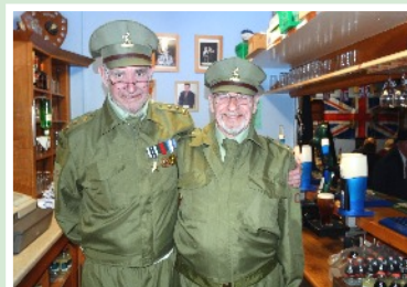
Good old Bar Guards